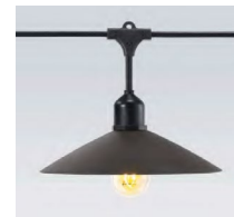
LSS-PCS PLASTIC CAGE SHADE