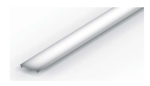
ALP-190 | Aluminum Profile